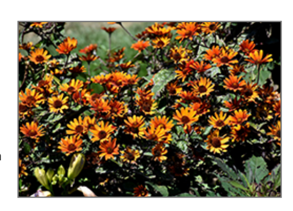
Bleeding Hearts False Sunflower flowers

This plant does best in full sun to partial shade. It is very adaptable to both dry and moist locations, and should do just fine under typical garden conditions. It is not particular as to soil type or pH, and is able to handle environmental salt. It is highly tolerant of urban pollution and will even thrive in inner city environments. This is a selection of a native North American species. It can be propagated by division; however, as a cultivated variety, be aware that it may be subject to certain restrictions or prohibitions on propagation.