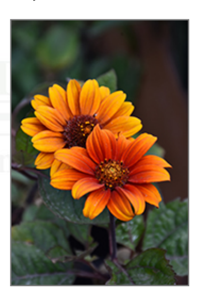
Bleeding Hearts False Sunflower flowers