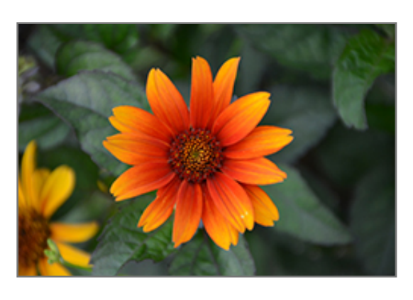
Bleeding Hearts False Sunflower flowers

Bleeding Hearts False Sunflower has masses of beautiful red daisy flowers with orange overtones, brick red eyes and yellow tips at the ends of the stems from early summer to mid fall, which are most effective when planted in groupings. The flowers are excellent for cutting. Its serrated oval leaves emerge green in spring, turning dark green in colour with showy deep purple variegation throughout the season. The deep purple stems can be quite attractive.