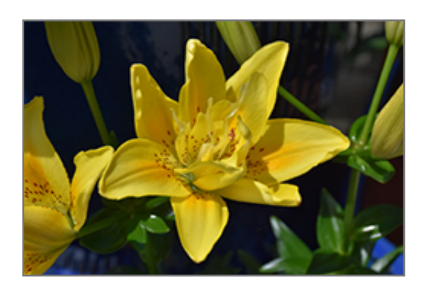
Fata Morgana Lily flowers