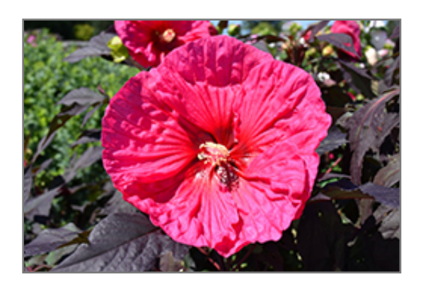
Summerific Evening Rose Hibiscus flowers

Summerific Evening Rose Hibiscus features bold hot pink round flowers with crimson eyes at the ends of the stems from mid to late summer. Its attractive large glossy oval leaves emerge green in spring, turning burgundy in colour with distinctive dark red veins and tinges of dark gray throughout the season.