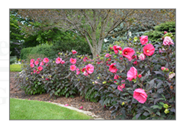
Summerific Evening Rose Hibiscus in bloom