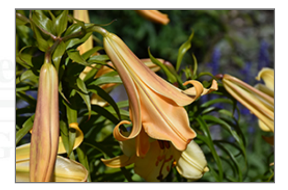
African Queen Lily flowers

African Queen Lily features bold fragrant peach trumpet-shaped flowers with buttery yellow overtones and burgundy stripes at the ends of the stems in early summer. The flowers are excellent for cutting. Its glossy narrow leaves remain green in colour throughout the season.