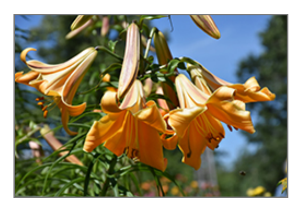
African Queen Lily flowers

Height: 5 feet Spread: 24 inches Spacing: 18 inches Sunlight: ○ ● Hardiness Zone: 4a Other Names: Trumpet Lily Group/Class: Aurelian Hybrid