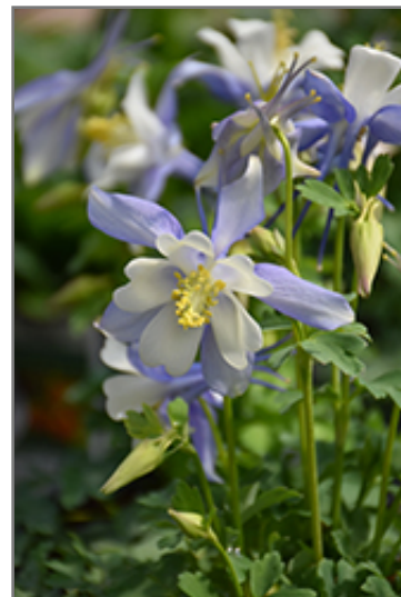
Kirigami Deep Blue and White Columbine flowers

Kirigami Deep Blue and White Columbine is an herbaceous perennial with an upright spreading habit of growth. Its relatively fine texture sets it apart from other garden plants with less refined foliage.