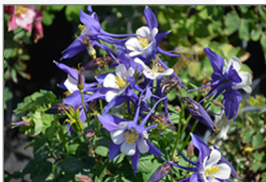
Kirigami Deep Blue and White Columbine flowers