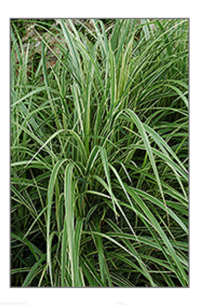
Variegated Silver Grass

This plant does best in full sun to partial shade. It prefers to grow in average to moist conditions, and shouldn't be allowed to dry out. It is not particular as to soil type or pH. It is highly tolerant of urban pollution and will even thrive in inner city environments. This is a selected variety of a species not originally from North America. It can be propagated by division; however, as a cultivated variety, be aware that it may be subject to certain restrictions or prohibitions on propagation.