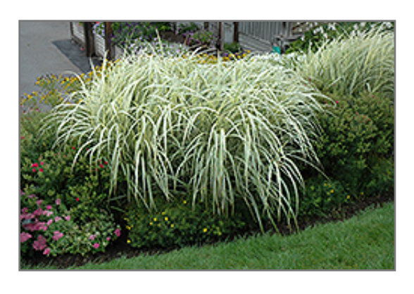
Variegated Silver Grass

Variegated Silver Grass is recommended for the following landscape applications;