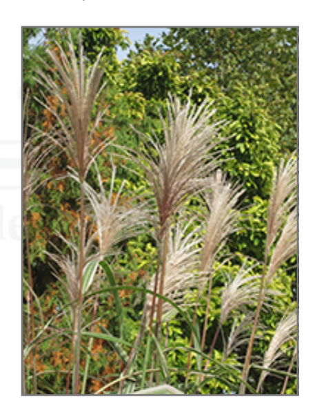
Variegated Silver Grass flowers