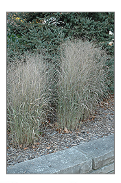
Shenandoah Reed Switch Grass in fall

This plant does best in full sun to partial shade. It is very adaptable to both dry and moist locations, and should do just fine under typical garden conditions. It is considered to be drought-tolerant, and thus makes an ideal choice for a low-water garden or xeriscape application. It is not particular as to soil type, but has a definite preference for alkaline soils, and is able to handle environmental salt. It is somewhat tolerant of urban pollution. This is a selection of a native North American species. It can be propagated by division; however, as a cultivated variety, be aware that it may be subject to certain restrictions or prohibitions on propagation.