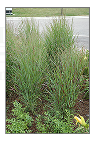
Shenandoah Reed Switch Grass