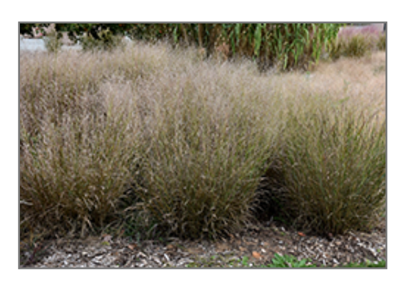
Shenandoah Reed Switch Grass fruit