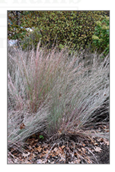
The Blues Bluestem in fall