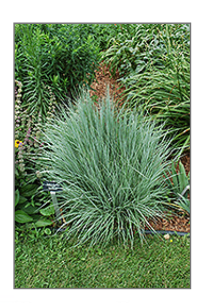
The Blues Bluestem