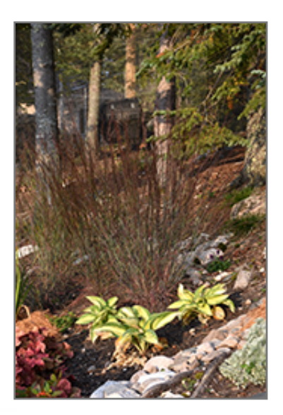
The Blues Bluestem

This plant should only be grown in full sunlight. It is very adaptable to both dry and moist locations, and should do just fine under typical garden conditions. It is considered to be drought-tolerant, and thus makes an ideal choice for a low-water garden or xeriscape application. It is not particular as to soil type or pH. It is somewhat tolerant of urban pollution. This is a selection of a native North American species. It can be propagated by division; however, as a cultivated variety, be aware that it may be subject to certain restrictions or prohibitions on propagation.