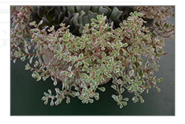
Tricolor Stonecrop