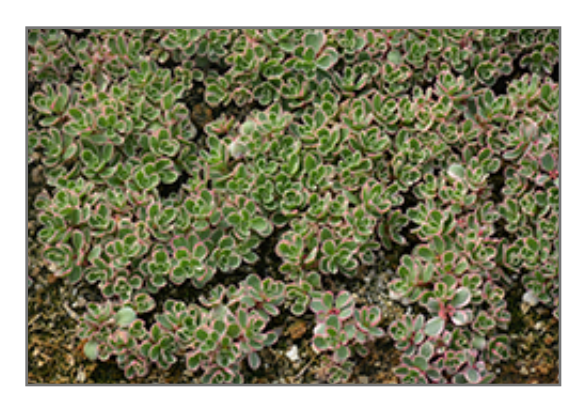
Tricolor Stonecrop flowers

Tricolor Stonecrop will grow to be only 4 inches tall at maturity, with a spread of 18 inches. When grown in masses or used as a bedding plant, individual plants should be spaced approximately 15 inches apart. Its foliage tends to remain low and dense right to the ground. It grows at a fast rate, and under ideal conditions can be expected to live for approximately 10 years. As an herbaceous perennial, this plant will usually die back to the crown each winter, and will regrow from the base each spring. Be careful not to disturb the crown in late winter when it may not be readily seen!