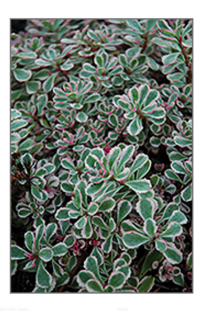
Tricolor Stonecrop foliage