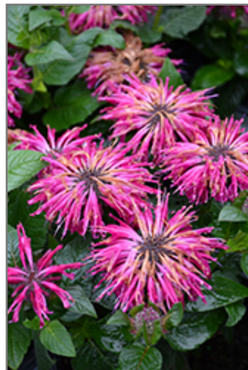
Leading Lady Razzberry Beebalm flowers

This variety forms a dense, compact mound of bright, raspberry purple flowers, on well branched, strong stems, over lush dark green foliage that has an excellent resistance to powdery mildew; great for massing along border fronts