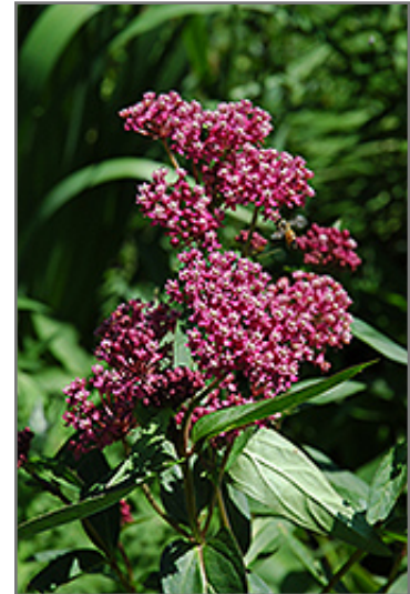
Swamp Milkweed flowers

This is a relatively low maintenance plant, and is best cleaned up in early spring before it resumes active growth for the season. It is a good choice for attracting butterflies to your yard, but is not particularly attractive to deer who tend to leave it alone in favor of tastier treats. It has no significant negative characteristics.