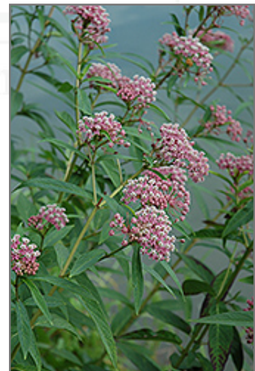
Swamp Milkweed flowers