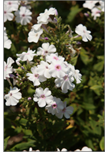
Ka-Pow White Garden Phlox flowers

Long lasting, fragrant white flowers begin in late spring; series has excellent branching characteristics with flowers in abundance all season; suitable for containers or perennial borders; good mildew resistance