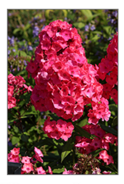
Super Ka-Pow Coral Garden Phlox flowers

Long lasting, fragrant, coral flowers with fuchsia centers, begin to emerge in late spring; series has exceptional branching characteristics with large flowers in abundance all season; suitable for containers or perennial borders; good mildew resistance