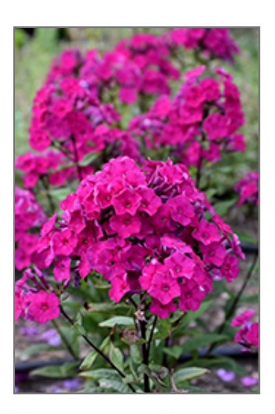
Super Ka-Pow Fuchsia Garden Phlox flowers

Long lasting, fragrant, bright fuchsia flowers begin to emerge in late spring; series has exceptional branching characteristics with large flowers in abundance all season; suitable for containers or perennial borders; good mildew resistance