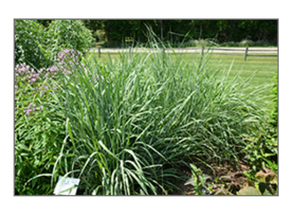
Indian Grass

A clump forming native grass producing tall blue-green blades which turn gold in fall, and retain some color through the winter; light brown, feathery panicles appear above the foliage in late summer, turning copper in fall; an excellent vertical accent