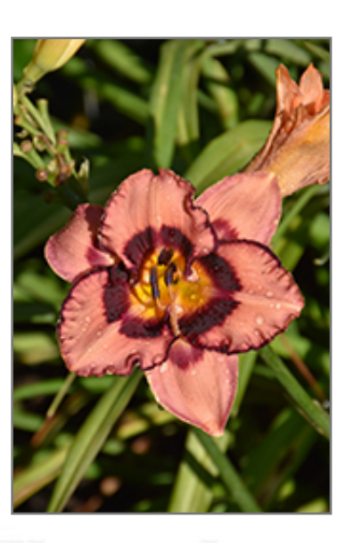
Hungry Eyes Daylily flowers

Low growing mounds of arching green foliage produce tall and sturdy stalks with large, light salmon and peach colored flowers contrasted by a striking wine-red eye and matching picotee edge; consistent rebloomer; adds softness to beds and borders