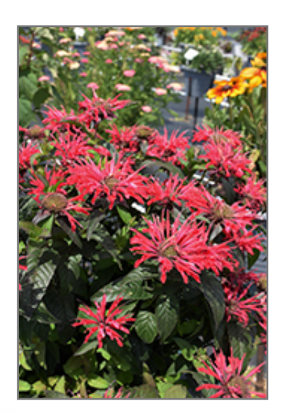
Upscale Red Velvet Beebalm flowers

Upscale Red Velvet Beebalm is an herbaceous perennial with a mounded form. Its medium texture blends into the garden, but can always be balanced by a couple of finer or coarser plants for an effective composition.