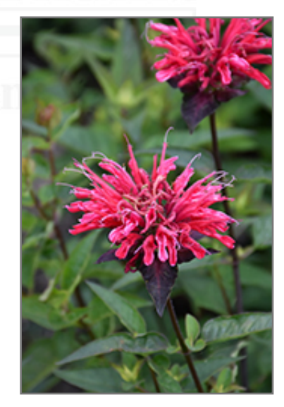
Upscale Red Velvet Beebalm flowers