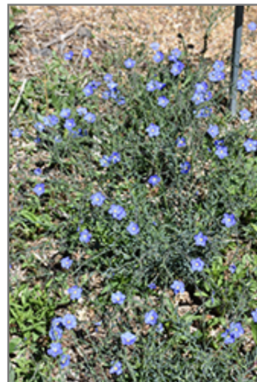
Wild Blue Flax flowers

This plant will require occasional maintenance and upkeep, and should be cut back in late fall in preparation for winter. It is a good choice for attracting bees and butterflies to your yard, but is not particularly attractive to deer who tend to leave it alone in favor of tastier treats. Gardeners should be aware of the following characteristic(s) that may warrant special consideration;