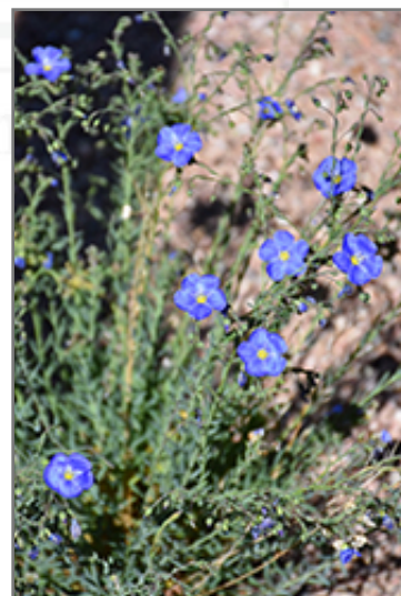
Wild Blue Flax flowers