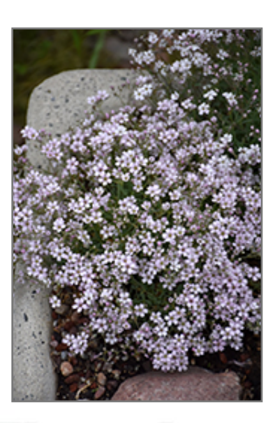
Pixie Splash Alpine Baby's Breath flowers

A low growing variety that is well suited for rock gardens, rock walls, or alpine troughs; a compact mound of rounded green leaves; taller branches are studded with white flowers blushed with pink; evergreen in milder areas