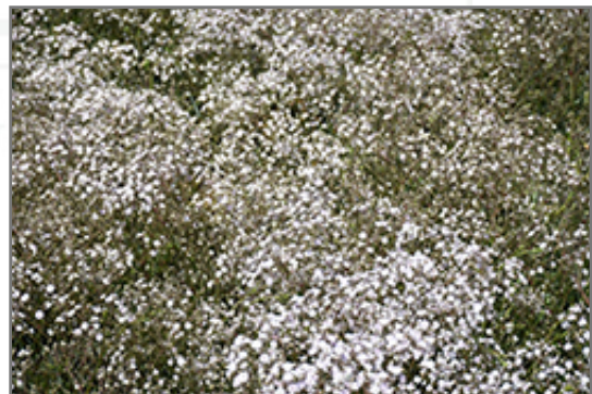
Festival White Baby's Breath in bloom