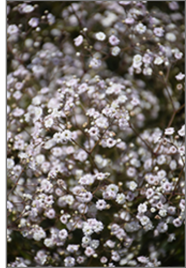
Festival White Baby's Breath flowers