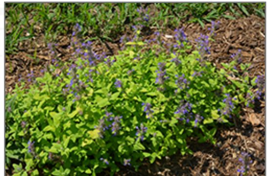
Chartreuse On The Loose Catmint in bloom