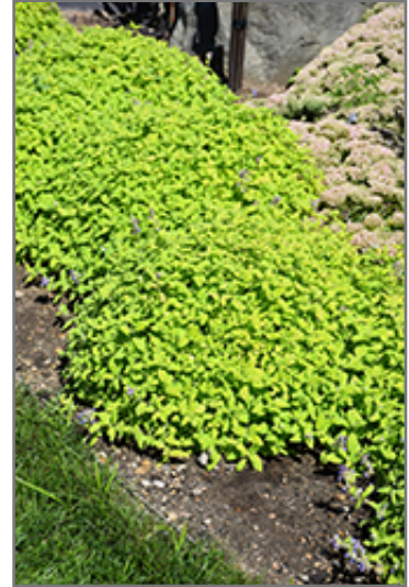
Chartreuse On The Loose Catmint

Chartreuse On The Loose Catmint is a dense herbaceous perennial with a mounded form. Its relatively fine texture sets it apart from other garden plants with less refined foliage.