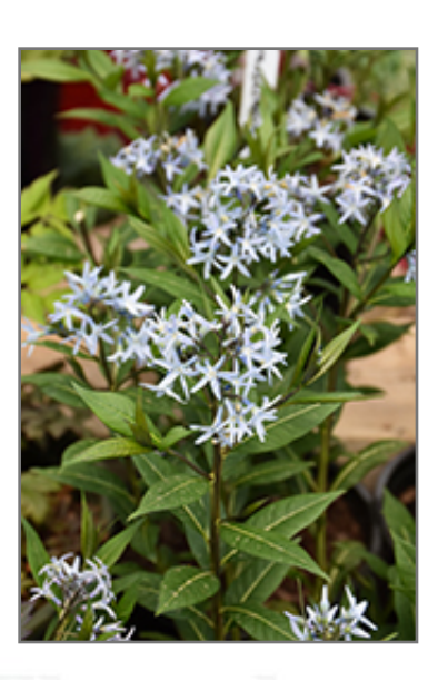
Starstruck Blue Star flowers

Star shaped, sky blue flowers in terminal clusters appear in late spring over vibrant green leaves with lighter midribs; beautiful fall color in tones of yellow-gold with orange highlights; great for borders, mixed beds, or a native garden