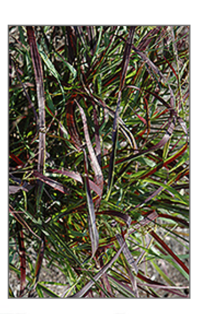
Blood Brothers Red Switch Grass foliage

Blood Brothers Red Switch Grass features airy plumes of tan flowers rising above the foliage in mid summer. Its attractive grassy leaves are bluish-green in colour with showy plum purple variegation. As an added bonus, the foliage turns a gorgeous brick red in the fall. The tan seed heads are carried on showy plumes displayed in abundance from late summer to mid fall.