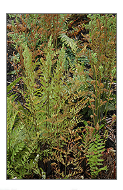
Royal Fern in spring

This plant performs well in both full sun and full shade. It prefers to grow in moist to wet soil, and will even tolerate some standing water. It is not particular as to soil type or pH. It is somewhat tolerant of urban pollution. Consider applying a thick mulch around the root zone over the growing season to conserve soil moisture. This species is not originally from North America. It can be propagated by division.