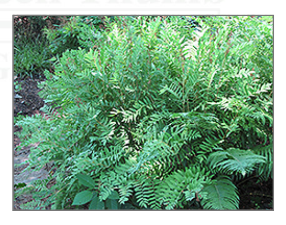
Royal Fern