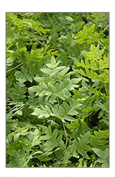
Royal Fern foliage