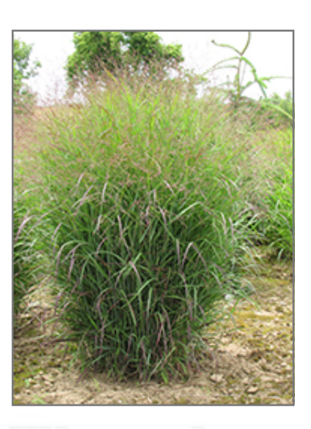
Prairie Sky Switch Grass

Prairie Sky Switch Grass features airy plumes of rose flowers rising above the foliage in mid summer. Its attractive grassy leaves are steel blue in colour. As an added bonus, the foliage turns a gorgeous gold in the fall. The brick red seed heads are carried on showy plumes displayed in abundance from late summer to mid fall. The tan stems can be quite attractive.