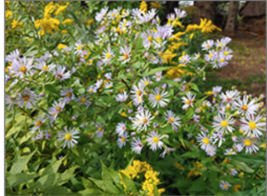
New York Aster flowers

New York Aster is recommended for the following landscape applications;