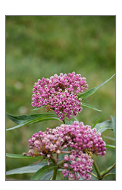
Soulmate Milkweed flowers

Soulmate Milkweed has lightly-scented rose flat-top flowers at the ends of the stems from mid summer to early fall. The flowers are excellent for cutting. Its narrow leaves remain green in colour throughout the season.