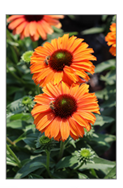
SunSeekers Mineola Coneflower flowers

An outstanding series with eye catching color; strong and bushy habit that is ideal for sunny borders and mixed containers; large and fragrant flowers have striking tangerine-orange petal surrounding deep copperred cones; deadhead spent blooms