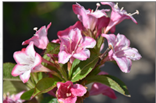
Carnaval Weigela flowers