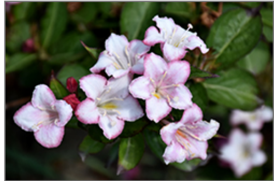
Carnaval Weigela flowers

Carnaval Weigela is recommended for the following landscape applications;