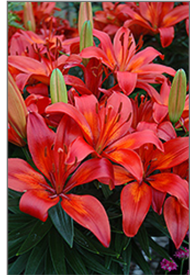
Matrix Lily flowers

Matrix Lily is recommended for the following landscape applications;