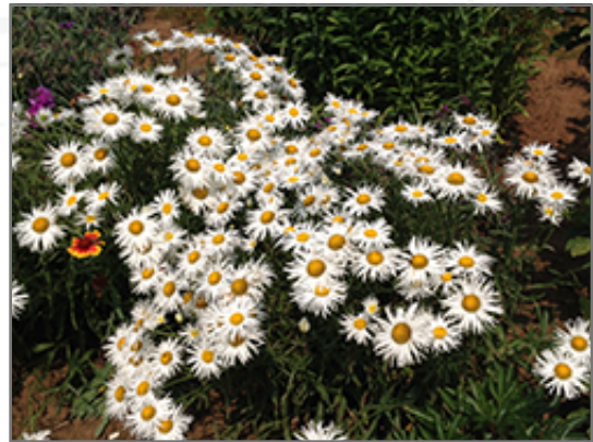
Crazy Daisy Shasta Daisy in bloom