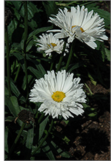
Crazy Daisy Shasta Daisy flowers

Crazy Daisy Shasta Daisy is an herbaceous perennial with an upright spreading habit of growth. Its medium texture blends into the garden, but can always be balanced by a couple of finer or coarser plants for an effective composition.