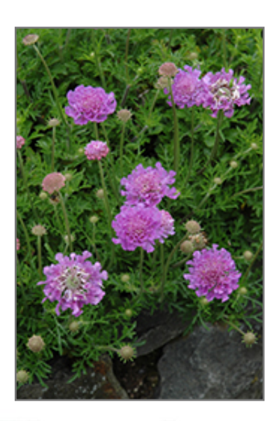
Vivid Violet Pincushion Flower flowers

Large intensely violet-colored flowers hover and sway over the low mounds of foliage continuously throughout the summer on this improved mildew resistant pincushion flower