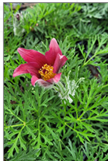
Red Pasqueflower flowers