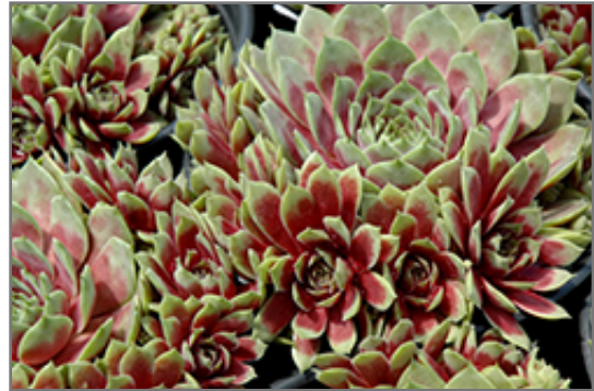
Commander Hay Hens And Chicks