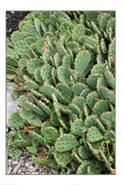
Prickly Pear Cactus

Prickly Pear Cactus is a member of the cactus family, which are grown primarily for their characteristic shapes, their interesting features and textures, and their high tolerance for hot, dry growing environments. As an 'opuntiad' type of cactus, it doesn't actually have leaves, but rather modified succulent stems that comprise the bulk of the plant, and which are designed to retain water for long periods of time. This particular cactus is valued for its spreading habit of growth This plant features showy yellow cup-shaped flowers at the ends of the stems from mid spring to mid summer. It produces red berries in late summer.