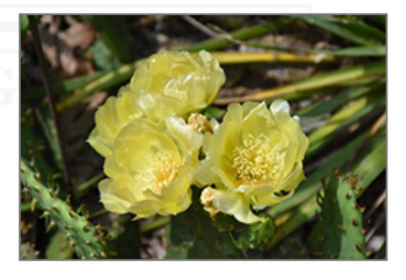
Prickly Pear Cactus flowers