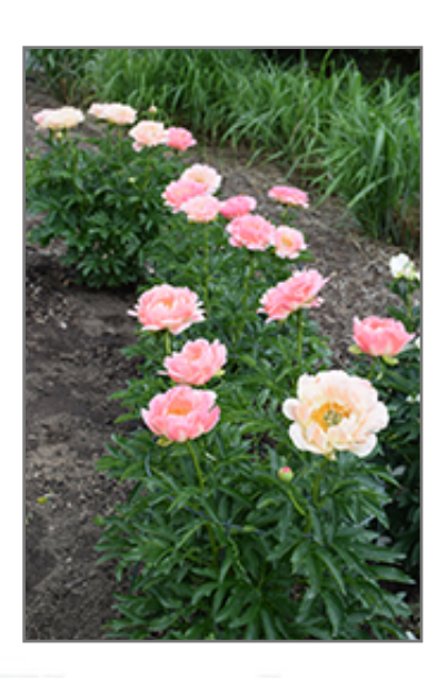
Coral Sunset Peony in bloom

Coral Sunset Peony will grow to be about 24 inches tall at maturity extending to 3 feet tall with the flowers, with a spread of 3 feet. When grown in masses or used as a bedding plant, individual plants should be spaced approximately 30 inches apart. The flower stalks can be weak and so it may require staking in exposed sites or excessively rich soils. It grows at a slow rate, and under ideal conditions can be expected to live for approximately 20 years. As an herbaceous perennial, this plant will usually die back to the crown each winter, and will regrow from the base each spring. Be careful not to disturb the crown in late winter when it may not be readily seen!