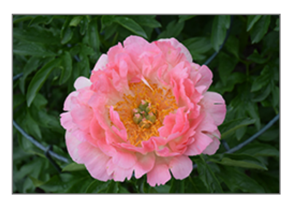
Coral Sunset Peony flowers (faded)

This is a relatively low maintenance plant, and should be cut back in late fall in preparation for winter. It is a good choice for attracting bees and butterflies to your yard, but is not particularly attractive to deer who tend to leave it alone in favor of tastier treats. Gardeners should be aware of the following characteristic(s) that may warrant special consideration;