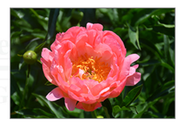
Coral Sunset Peony flowers