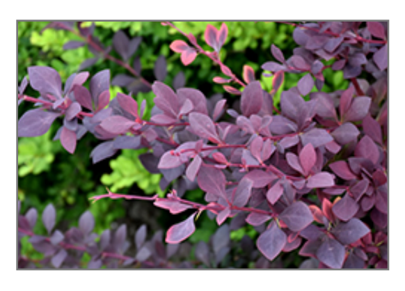
Royal Cloak Japanese Barberry foliage