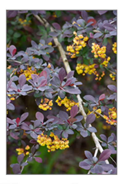
Royal Cloak Japanese Barberry flowers

This shrub should only be grown in full sunlight. It does best in average to evenly moist conditions, but will not tolerate standing water. It is not particular as to soil type or pH. It is highly tolerant of urban pollution and will even thrive in inner city environments. This is a selected variety of a species not originally from North America.