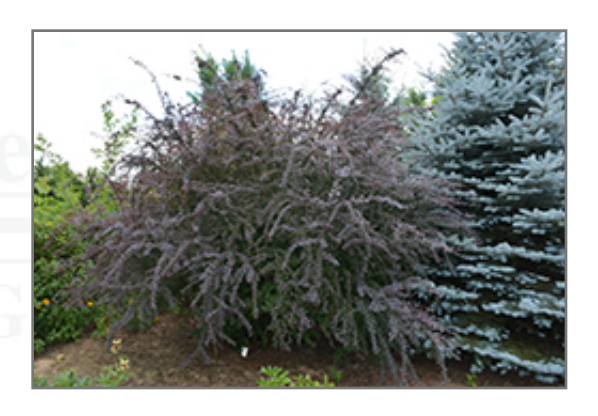
Royal Cloak Japanese Barberry