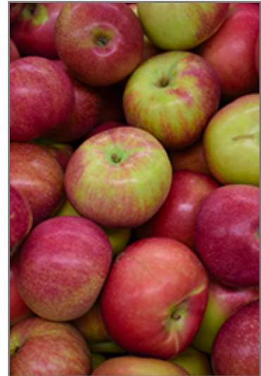
Macintosh Apple fruit

Macintosh Apple features showy clusters of lightly-scented white flowers with shell pink overtones along the branches in mid spring, which emerge from distinctive pink flower buds. It has forest green foliage throughout the season. The pointy leaves turn yellow in fall. The fruits are showy red apples with hints of light green, which are carried in abundance in early fall. The fruit can be messy if allowed to drop on the lawn or walkways, and may require occasional clean-up.