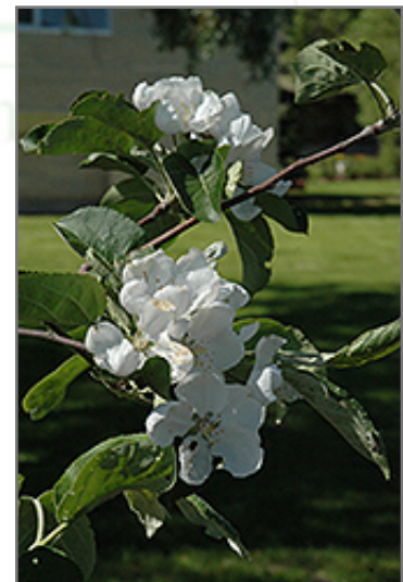
Macintosh Apple flowers