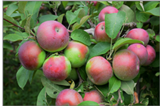
Macintosh Apple fruit