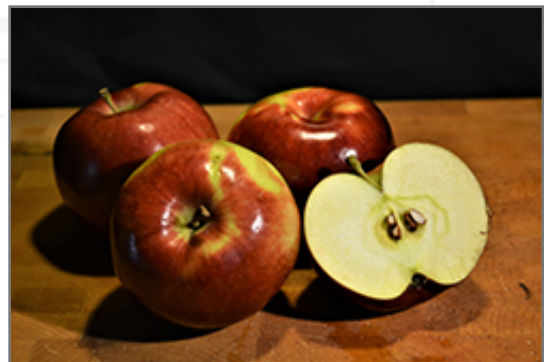
Empire Apple fruit and flesh