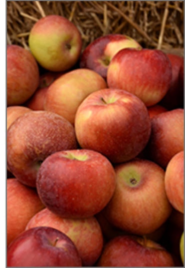
Empire Apple fruit