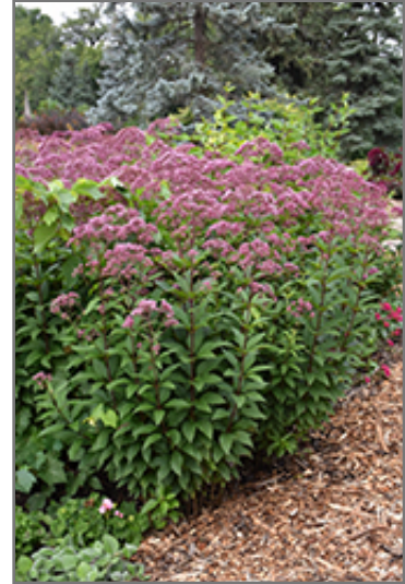
Joe Pye Weed in bloom

This is a relatively low maintenance plant, and is best cleaned up in early spring before it resumes active growth for the season. It is a good choice for attracting butterflies to your yard, but is not particularly attractive to deer who tend to leave it alone in favor of tastier treats. It has no significant negative characteristics.