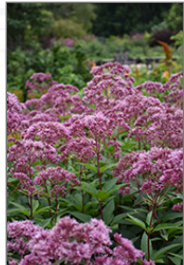
Joe Pye Weed flowers