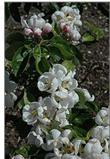
Spartan Apple flowers