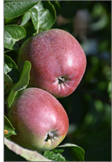
Spartan Apple fruit

Spartan Apple features showy clusters of lightly-scented white flowers with shell pink overtones along the branches in mid spring, which emerge from distinctive pink flower buds. It has forest green deciduous foliage. The pointy leaves turn yellow in fall. The fruits are showy dark red apples with a green blush, which are carried in abundance in mid fall. The fruit can be messy if allowed to drop on the lawn or walkways, and may require occasional clean-up.