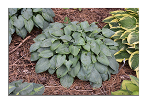
Fragrant Blue Hosta

Fragrant Blue Hosta is recommended for the following landscape applications;