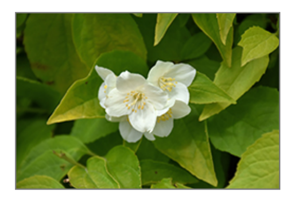
Golden Mockorange flowers

Golden Mockorange is a dense multi-stemmed deciduous shrub with an upright spreading habit of growth. Its average texture blends into the landscape, but can be balanced by one or two finer or coarser trees or shrubs for an effective composition.