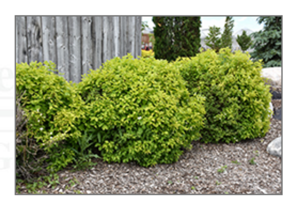
Golden Mockorange

This is a relatively low maintenance shrub, and should only be pruned after flowering to avoid removing any of the current season's flowers. It has no significant negative characteristics.