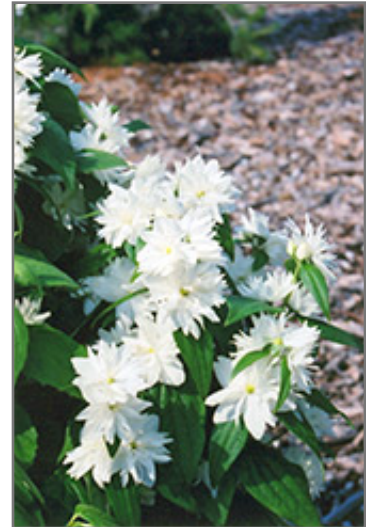
Minnesota Snowflake Mockorange flowers