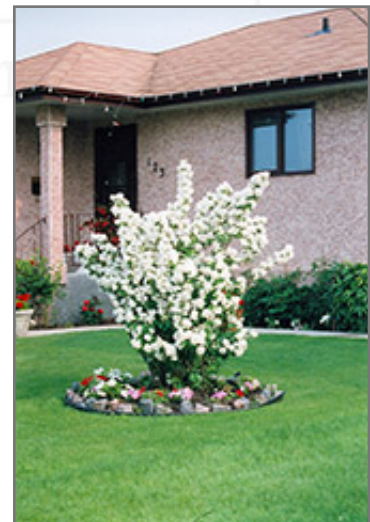
Minnesota Snowflake Mockorange in bloom