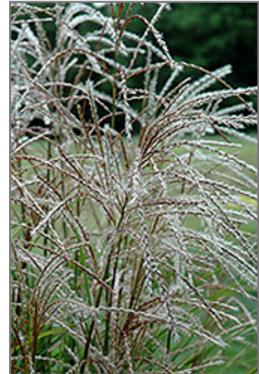
Huron Sunrise Maiden Grass flowers

This plant does best in full sun to partial shade. It prefers to grow in average to moist conditions, and shouldn't be allowed to dry out. It is not particular as to soil type or pH. It is highly tolerant of urban pollution and will even thrive in inner city environments. This is a selected variety of a species not originally from North America. It can be propagated by division; however, as a cultivated variety, be aware that it may be subject to certain restrictions or prohibitions on propagation.