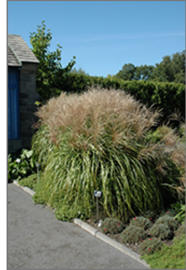
Huron Sunrise Maiden Grass

Huron Sunrise Maiden Grass is recommended for the following landscape applications;