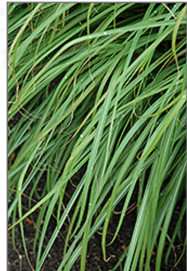
Huron Sunrise Maiden Grass foliage