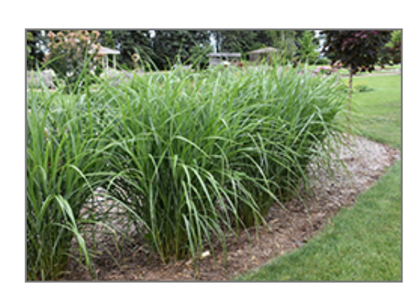
Malepartus Maiden Grass

This variety produces an arching mound of green foliage a tall arching cascade of soft pink plumes rise above foliage in fall and mature to silver; great winter interest