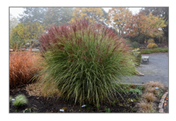
Morning Light Maiden Grass fruit

This plant will require occasional maintenance and upkeep, and is best cleaned up in early spring before it resumes active growth for the season. It has no significant negative characteristics.