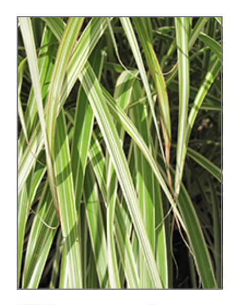
Morning Light Maiden Grass foliage

Morning Light Maiden Grass will grow to be about 4 feet tall at maturity, with a spread of 3 feet. It tends to be leggy, with a typical clearance of 1 foot from the ground, and should be underplanted with lower-growing perennials. It grows at a medium rate, and under ideal conditions can be expected to live for approximately 20 years. As an herbaceous perennial, this plant will usually die back to the crown each winter, and will regrow from the base each spring. Be careful not to disturb the crown in late winter when it may not be readily seen!