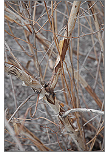
Diablo Ninebark bark

This shrub does best in full sun to partial shade. It is very adaptable to both dry and moist locations, and should do just fine under average home landscape conditions. It is not particular as to soil type or pH. It is highly tolerant of urban pollution and will even thrive in inner city environments. This is a selection of a native North American species.