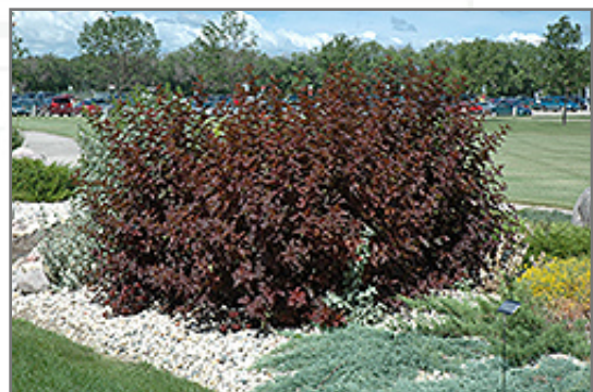
Diablo Ninebark