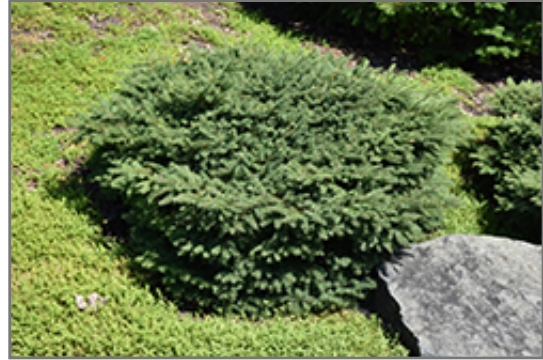
Birds Nest Spruce

Birds Nest Spruce is recommended for the following landscape applications;