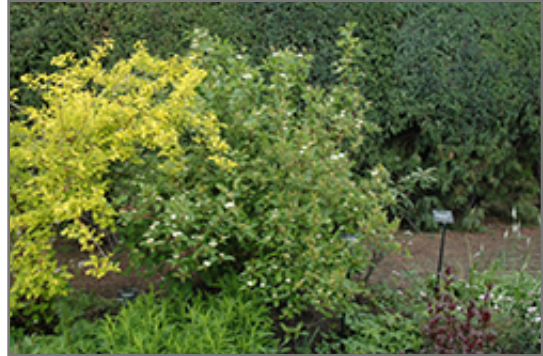
Red Osier Dogwood

This shrub does best in full sun to partial shade. It is an amazingly adaptable plant, tolerating both dry conditions and even some standing water. It is not particular as to soil type or pH. It is highly tolerant of urban pollution and will even thrive in inner city environments. This species is native to parts of North America.