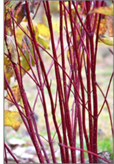
Red Osier Dogwood stems

This shrub will require occasional maintenance and upkeep, and can be pruned at anytime. It is a good choice for attracting birds to your yard. Gardeners should be aware of the following characteristic(s) that may warrant special consideration;