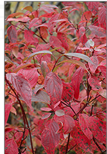
Red Osier Dogwood in fall